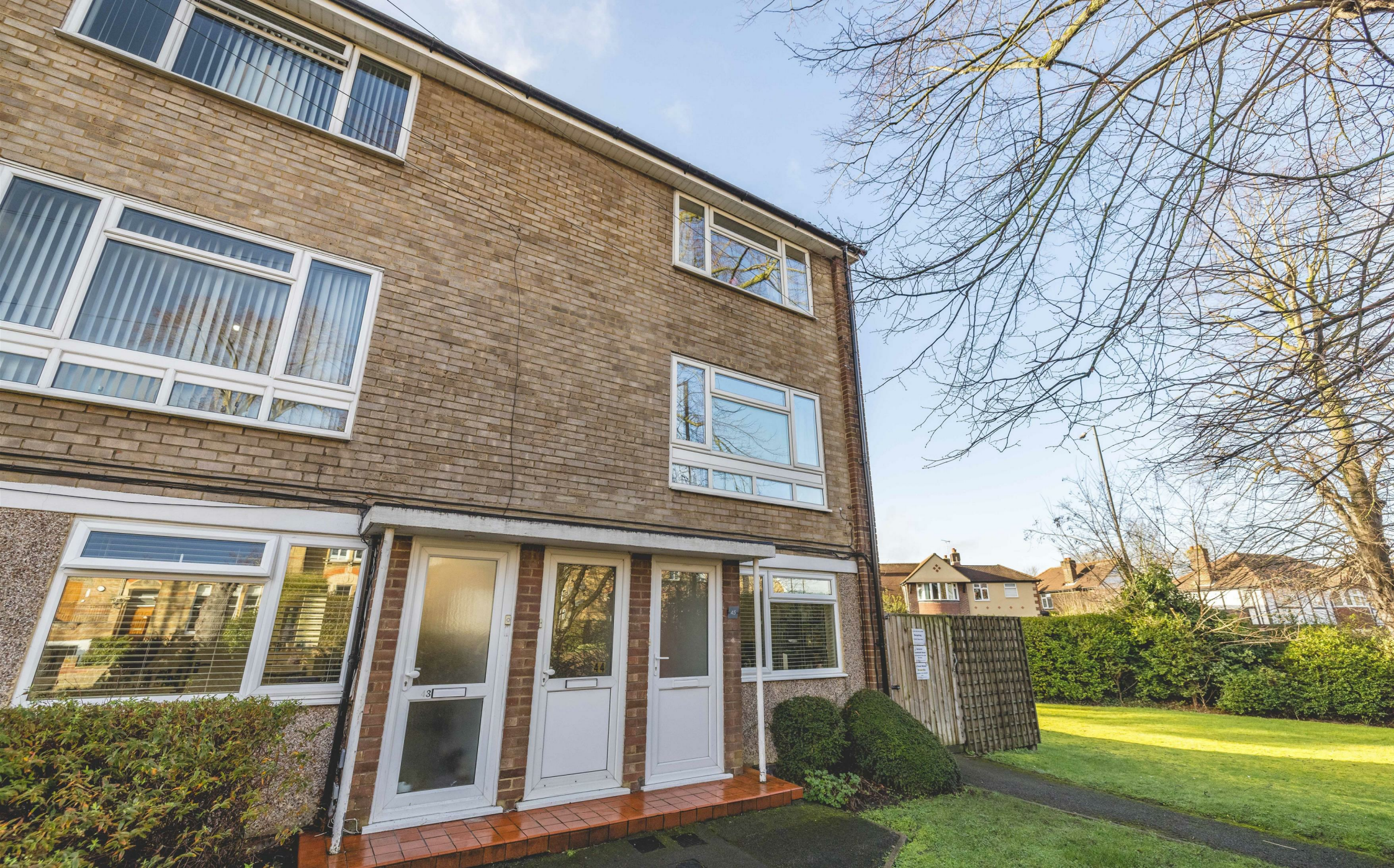
Flat 44, Osborne Court Osborne Road, Windsor, SL4 3EP £365,000